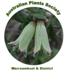
Warrnambool & District

The following is a list of suitable species for planting in Zones A/B, included as a guide, are conditions that these plants are particularly suited to or tolerant of.